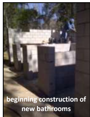
beginning construction of new bathrooms

~ Dale Cook Griffin, former camper and staff, nurse for two weeks in 2011